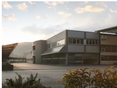
EPTA POLO 2 SASSOCORVARO (PU) ITALY