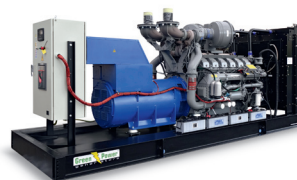
OPEN GENERATING SETS