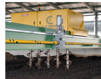
CLF MODIL - MIXING OF THE SOIL IMPROVER AFTER COMPLETION