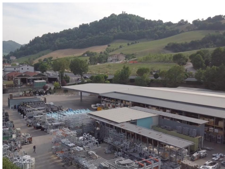
EPTA POLO 1 LUNANO (PU) ITALY