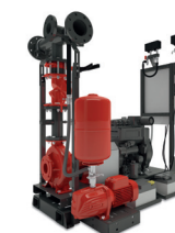
FIRE FIGHTING SYSTEMS