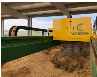
CLF MODIL - WASTE DISTRIBUTION SYSTEM