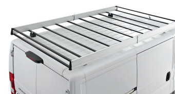
EQUIPMENT FOR COMMERCIAL VEHICLES