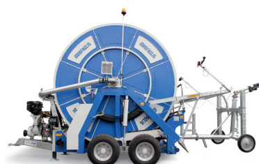
MACHINES AND MOTORPUMPS FOR IRRIGATION