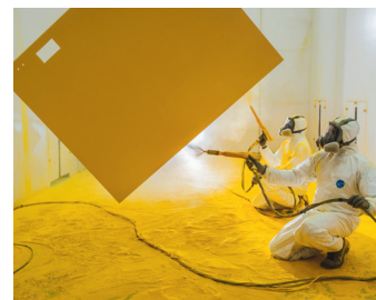
POWDER COATING OF METALS