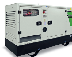
SOUNDPROOF GENERATING SETS