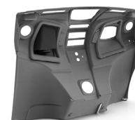
DASHBOARDS FOR INDUSTRIAL VEHICLES