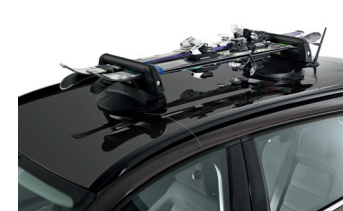
SKI RACKS AND CAR ACCESSORIES