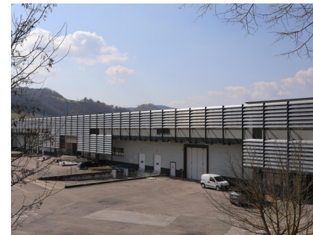
EPTA POLO 3 PIANDIMELETO (PU) ITALY