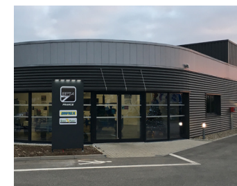
SHOWROOM AND SERVICE CENTRE