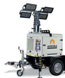
LIGHTING TOWERS WITH ENGINE, BATTERY OR HYBRID