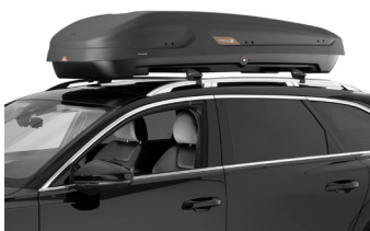
ROOF BARS AND ROOF BOXES