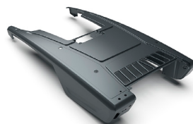
SPECIAL COMPONENTS FOR THE AUTOMOTIVE