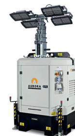
LIGHTING TOWERS WITH BATTERY AND ENGINE