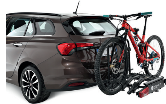
TOWBAR, TAILGATE AND ROOF BIKE CARRIERS