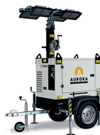
LIGHTING TOWERS WITH ENGINE