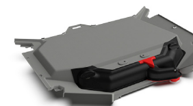
VEHICLE LININGS AND BODIES