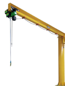
COLUMN-MOUNTED JIB CRANES WITH CANTILEVER ARM