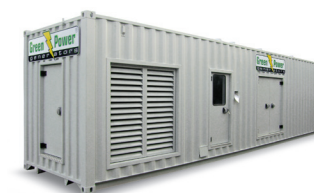
CONTAINER GENERATING SETS