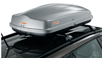
ROOF BARS AND ROOF BOXES