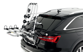
BIKE CARRIERS, SKI RACKS AND CAR ACCESSORIES