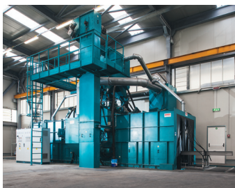
SANDBLASTING OF METALS